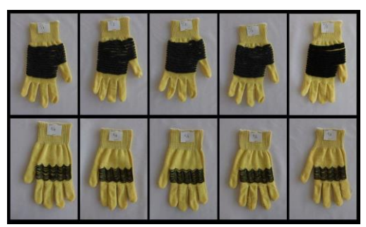
Figure 1. Knitted samples with special surface