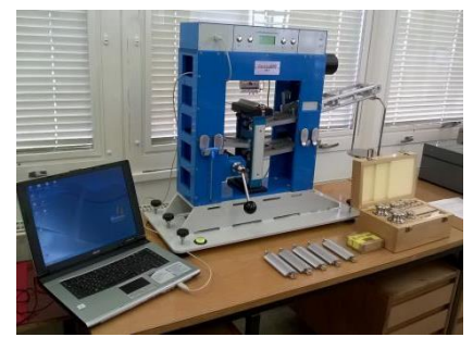
Figure 2. Cut resistance testing device in the laboratory of INNOVATEXT

"Coup Test" according to the EN 388 standard and the "TDM-100 Test" according to MSZ EN ISO 13997:2000 was performed to evaluate mechanical risks for hand protection. The "TDM-100" test was carried out on the testing device (Fig.2) developed by Hungarian partners for INNOVATEXT in the framework of the research. Test of heat resistance was performed according to MSZ EN 407:2004 .